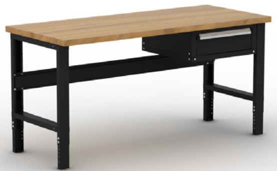
One Drawer Workbench

Available in seven (7) Borroughs standard colors.