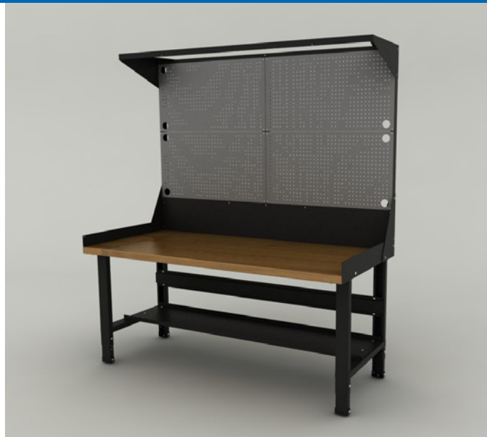
Cantilevered Frame Workbench

Available in seven (7) Borroughs standard colors.